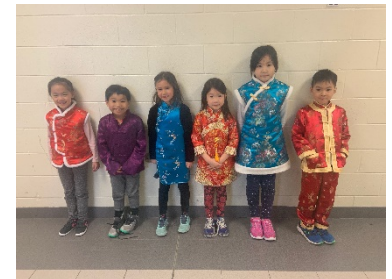
Celebrating Chinese New Year