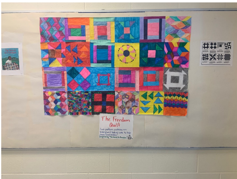
Grade 5's Freedom Quilt